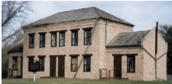
The reconstructed Upper Sioux Agency, Yellow Medicine County, Minnesota