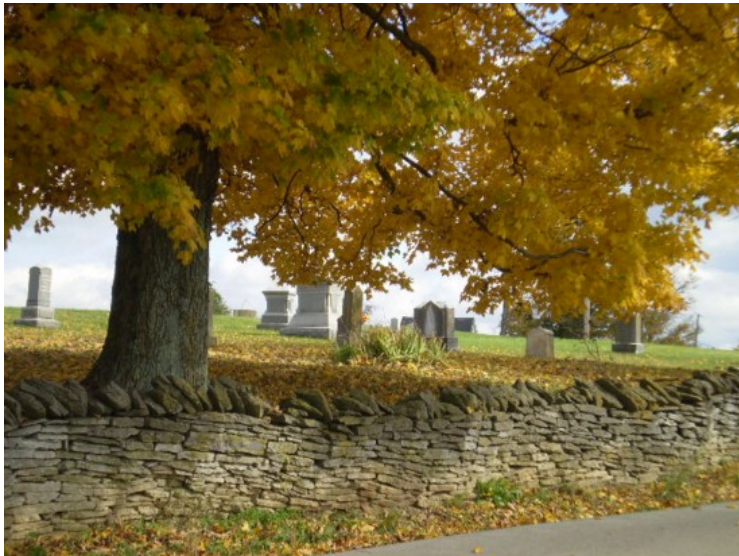
Little Mount Church Cemetery, Kentucky