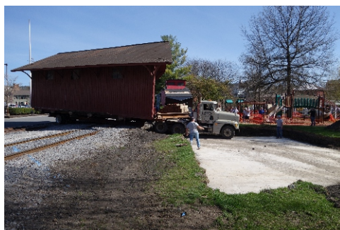
Crossing the Tracks